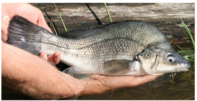
Adult Macquarie perch ready for release.

A recent intensive stocking program accompanied by robust scientific research resulted in the successful re-introduction of a now self-sustaining population of trout cod in the Ovens River. Macquarie perch are next in line, with a five year stocking program using fingerlings produced by Fisheries Victoria at the Snobs Creek fish hatchery and direct translocations of sub-adult fish from the healthy Lake Dartmouth population. The fingerlings and translocated fish will generate a range of age and developmental stages similar to that which exist in natural populations. This is an important first step toward re-establishing a self-sustaining Macquarie perch population with the long-term goal of creating a sustainable recreational fishery for the species.