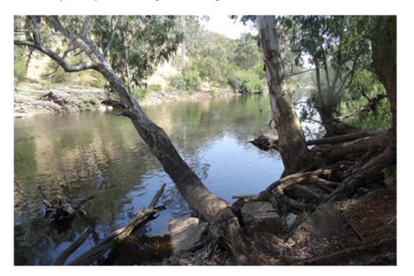
Healthy Ovens River habitat.

Key threats to the long-term survival of the Ovens River fish community include ongoing impacts from historical de-snagging e.g. reduced native fish breeding and recruitment, pest species e.g. carp, unregulated stock access, degraded riverbank vegetation, poor water quality and illegal fishing.