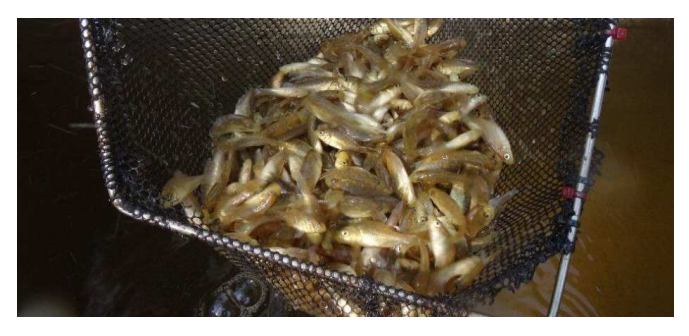
Fingerling's released into the Ovens River.

All stocked fingerlings will be chemically marked to enable researchers to distinguish them from wild fingerlings produced from future breeding and recruitment events.