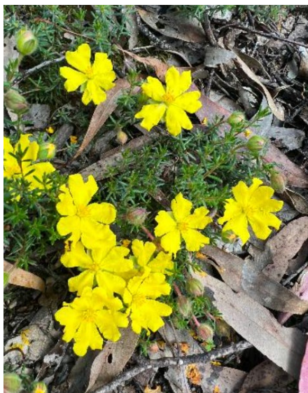
Hibbertia porcata