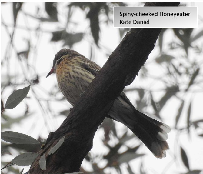
Spiny-cheeked Honeyeater