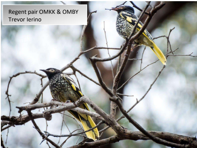
Regent pair OMKK & OMBY Trevor Ierino