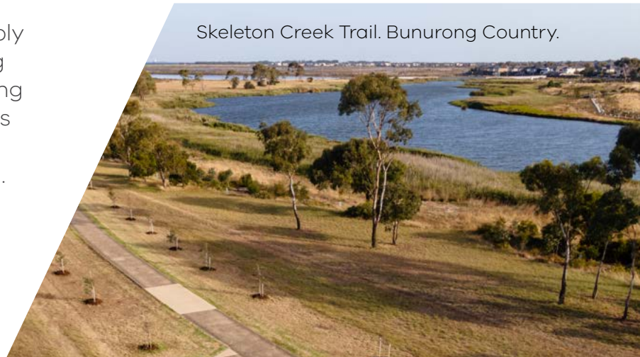
Skeleton Creek Trail. Bunurong Country.

Requests for access to information about you held by DEECA should be sent to the Manager Privacy, P.O. Box 500 East Melbourne 8002 or contact by emailing Foi.unit@delwp.vic.gov.au .