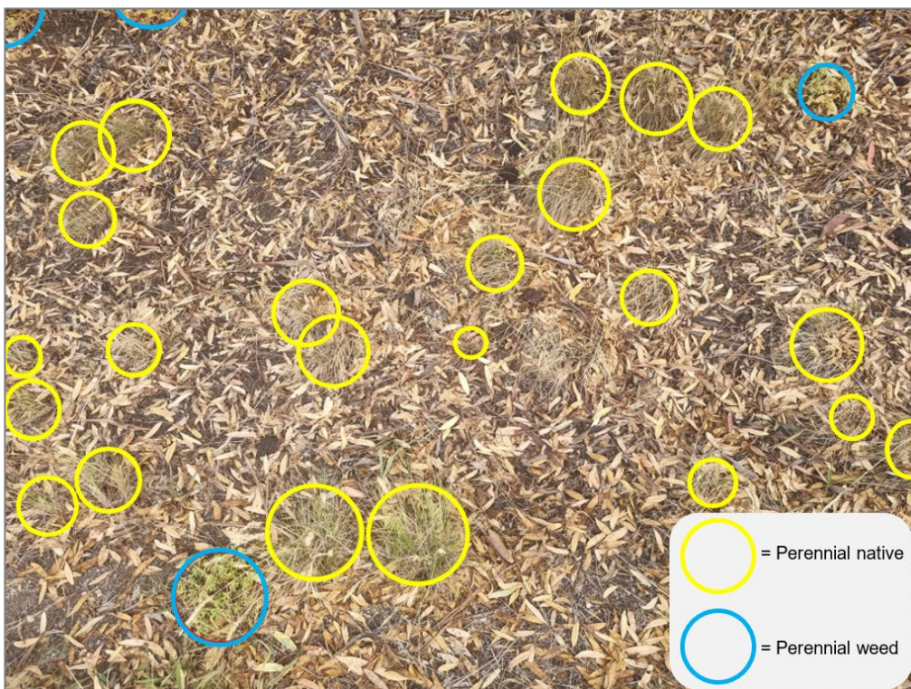
Figure 2: Example Patch with native plants and perennial weeds present