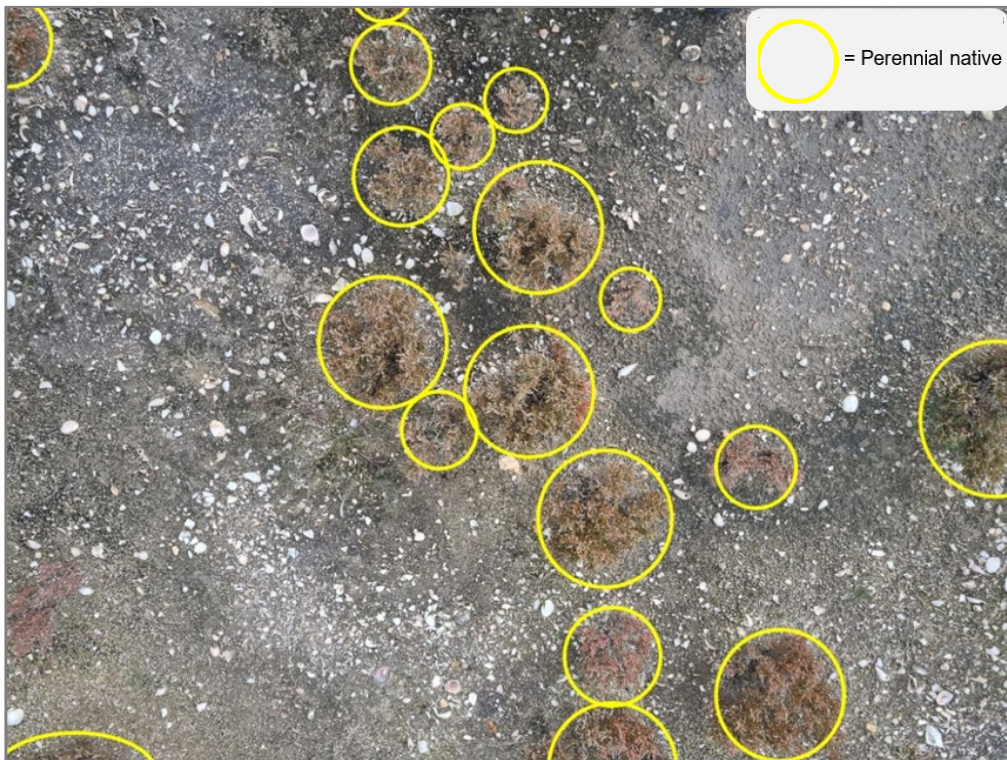
Figure 1: Example Patch with only native plants present