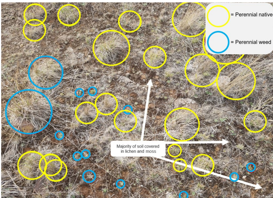
Figure 3: Example Patch with native plants, perennial weeds, and annual weeds present