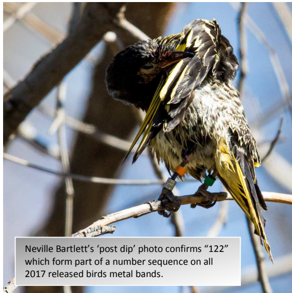
Neville Bartlett's 'post dip' photo confirms "122" which form part of a number sequence on all 2017 released birds metal bands.