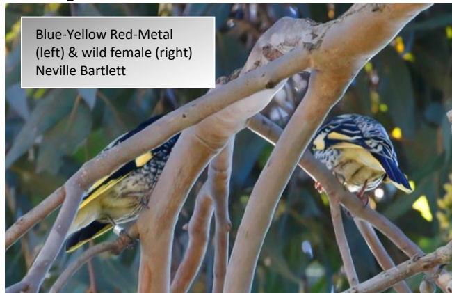
Blue-Yellow Red-Metal (left) & wild female (right) Neville Bartlett