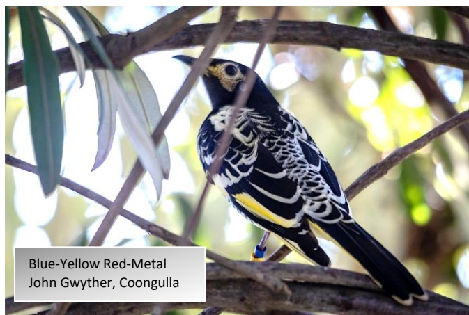
Blue-Yellow Red-Metal John Gwyther, Coongulla

Last Update #37 we reported on the amazing sighting of Blue-Yellow Red-Metal (BYRM) - the first confirmed sighting of a Regent five years post its release (2015 in this instance).