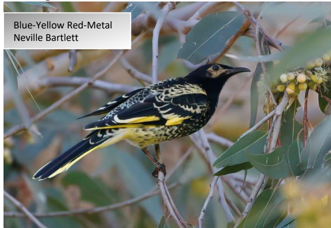
Blue-Yellow Red-Metal Neville Bartlett