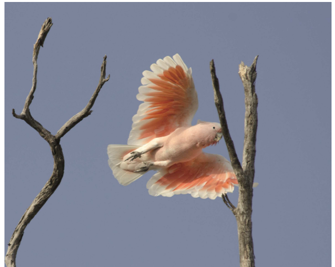
Major Mitchell's Cockatoo

Action Statements outline what has been done to conserve and manage a taxon or community or threatening process and what is intended to be done and may include information on what needs to be done. These proposed actions aim to help secure populations and enable the long-term persistence of an item. These actions often call for research to improve our understanding of an item's biology and the impacts of any threats. The proposed actions can be implemented by a range of organisations including government agencies, universities, environmental NGO's and community groups.