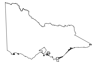
Southern Royal Albatross