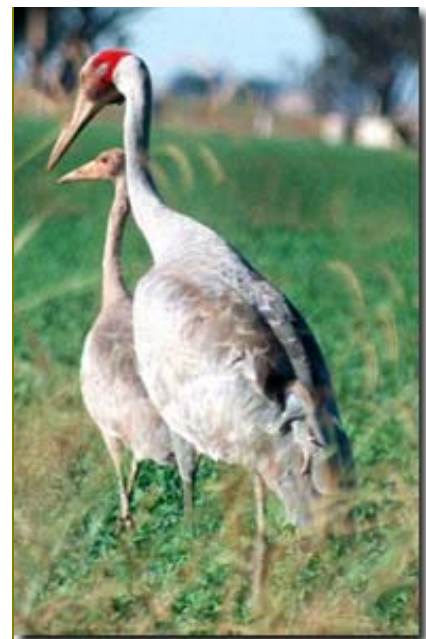
Brolga, Grus rubicunda

In Victoria, birds are currently found in the south-west, the Northern Plains and adjacent parts of the Murray River (Emison et al. 1987). The species was formerly more widely distributed and common, being recorded from the Melbourne area, Gippsland and North-eastern Victoria (White 1983).