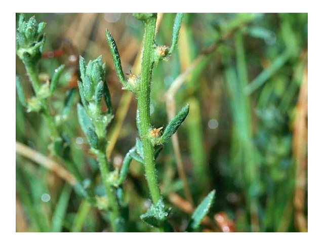
Turnip Copperburr (Sclerolaena napiformis)