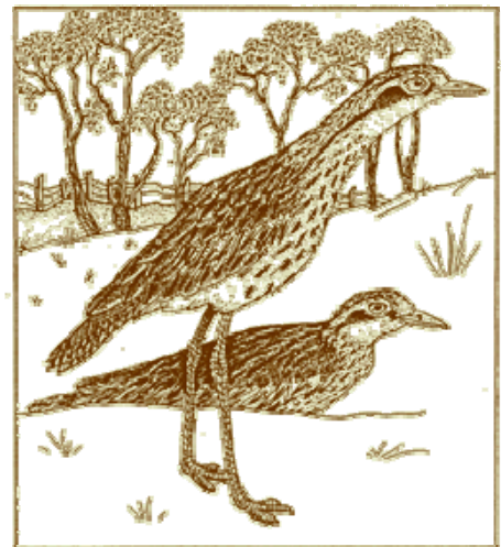
Bush Stone-Curlew Burhinus grallarius Illustration by Alexis Beckett

Although Bush Stone-curlews are taxonomically classified as wading birds (order Charadriiformes), they are classed ecologically as woodland birds (Robinson 1991). In Victoria they are found predominantly in lowland grassy woodland and open forest remnants of Grey Box Eucalyptus microcarpa , River Red Gum E. camaldulensis or Yellow Box E. melliodora , with a ground cover of low, sparse native grass and few or no shrubs (Johnson & Baker-Gabb 1994). They also occur in box-ironbark forests (L. Rowley, pers. comm.). Within these environments, birds occupy a permanent, loosely-defined home range of about 250-600 hectares. In the breeding season they defend a 10-25 hectare territory around the nest (Johnson & Baker-Gabb 1994).