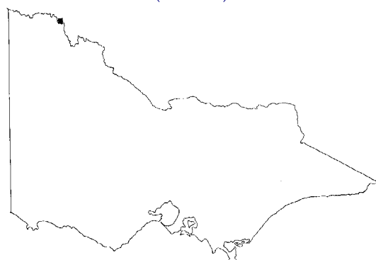
Previous known distribution of Tasmanian Pademelon in Victoria (DSE 2003)