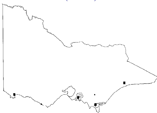
Previous known distribution of Red-tailed Phascogale in Victoria (DSE 2003)