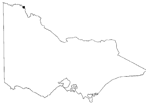
Previous known distribution of Bridled Nailtail Wallaby in Victoria (DSE 2003)