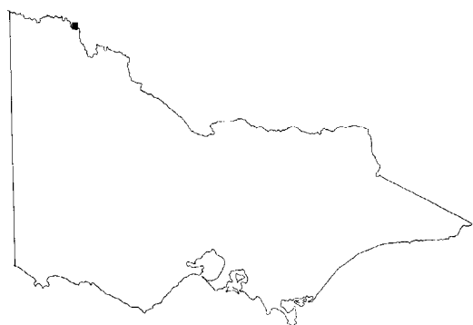
Previous known distribution of Brush-tailed Bettong in Victoria (DSE 2003)

Although discovery of Victorian populations of these species is not considered likely, it is important to remember that two mammals, the Mountain Pygmy-possum ( Burramys parvus ) and Leadbeaters Possum ( Gymnobelideus leadbeateri ), were both considered extinct until populations were discovered in the 1960s. For this reason it is appropriate to have contingency plans for these nine species although they are presumed extinct in Victoria.