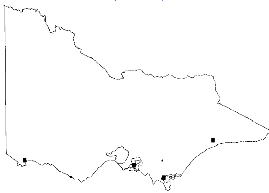
Previous known distribution of Red-tailed Phascogale in Victoria (DSE 2003)