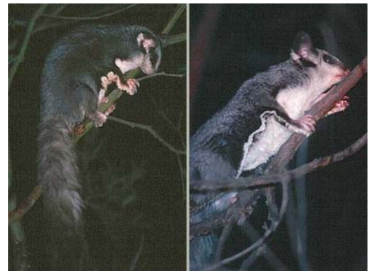
Squirrel Glider Petaurus norfolcensis

average annual rainfall of about 345–920mm. A major break in the distribution occurs between Stawell and Colbinabbin, with only one locality record (Stuart Mill) known from within this span of 185km (Menkhorst 1995).