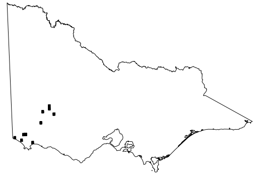
Distribution in Victoria NRE (2002)