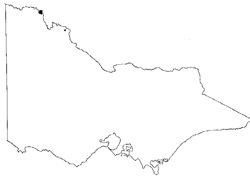
Previous known distribution of Lesser Stick-nest Rat in Victoria (DSE 2003)