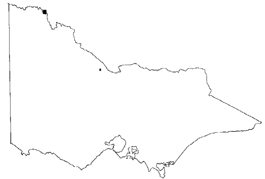
Previous known distribution of Eastern Hare-wallaby in Victoria (DSE 2003)